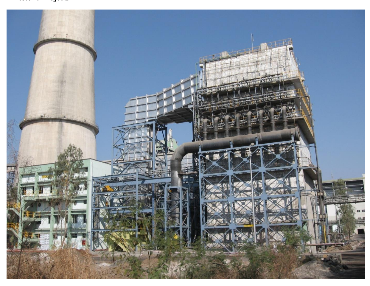
(India's first Sea water FGD system with 100% of flue gas, for 2 X 250 MW DahanuTermal Power Station at Dahanu, Maharashtra, India installed by Ducon)

FGD System is the core business of DUCON. Ducon has complete range of Air Pollution Control Systems to remove particulate matter and gaseous pollutants. This is an Air Pollution Control system which helps Thermal Power Plants and the captive Power plants of other industries to remove sulphur dioxide in Coal and Oil fired